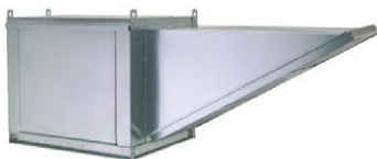
UNTEMPERED ROOFTOP FILTERED