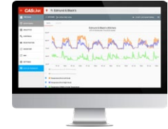
HARMONY CONTROLS WITH CASLINK MONITORING