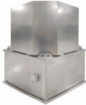
AXIAL ROOF MOUNT