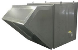
DIRECT DRIVE AXIAL WALL-MOUNT