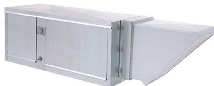
DIRECT FIRED COMPACT