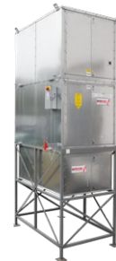
DIRECT FIRED VERTICAL