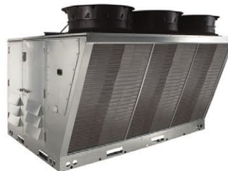
DEDICATED OUTDOOR AIR SYSTEM (DOAS)