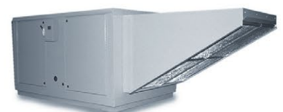
INDUSTRIAL DIRECT FIRED