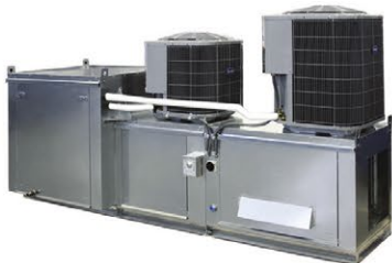
MODULAR PACKAGED UNIT