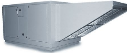
DIRECT FIRED HORIZONTAL