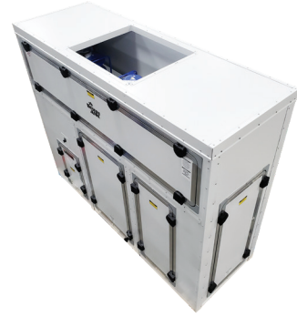
GreenAire™ with top discharge configuration shown.