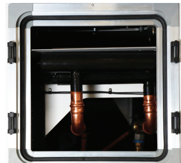
GreenAire™ hinged service doors open from either side and are removable.